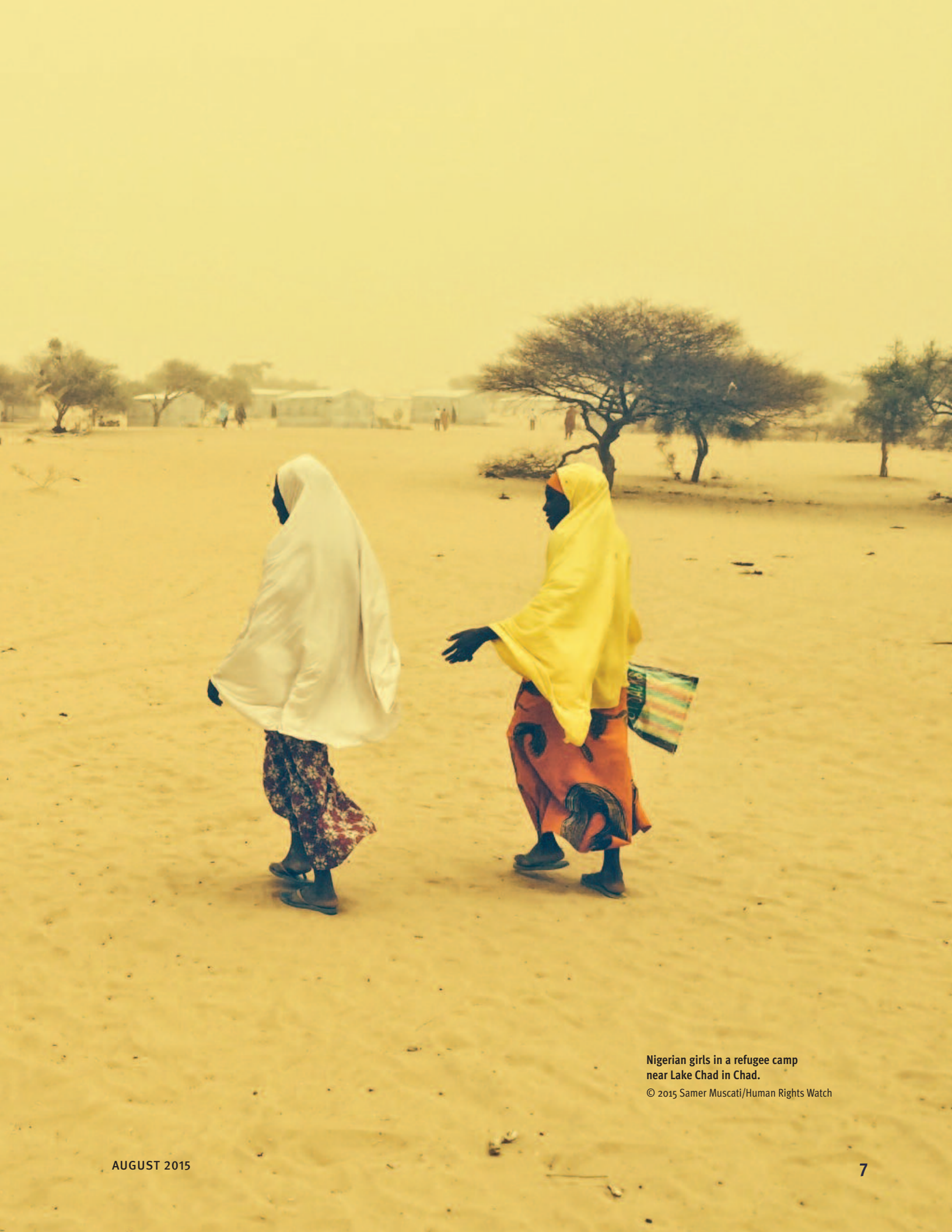
Nigerian girls in a refugee camp near Lake Chad in Chad.